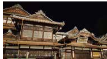
DOGO ONSEN, THE OLDEST ONSEN (HOT SPRING) WITH 3000 YEARS HISTORY