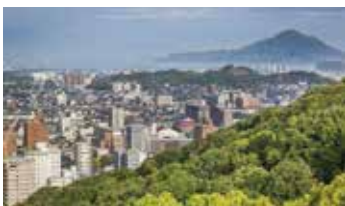
MATSUYAMA CITY, THE BIGGEST CITY ON SHIKOKU ISLAND

Matsuyama is the largest city on Shikoku Island, located in the northwestern region of the island. It is renowned for Dōgo Onsen, one of Japan's oldest and most famous hot springs, and Matsuyama Castle, a historic hilltop fortress. With its beautiful scenery and mild climate, Matsuyama is consistently ranked as the No. 1 regional city where Japanese people would most like to live. Matsuyama Airport, located nearby, provides convenient access to the city. The Ehime Budokan, which will serve as the venue for the tournament, is recognized as one of Japan's three major martial arts halls, alongside the Nippon Budokan and Tokyo Budokan.