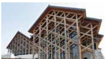
EHIME BUDOKAN, THE TOURNAMENT VENUE