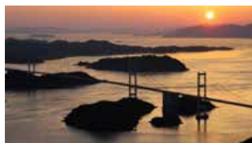
BEAUTIFUL SETONAIKAI INLAND SEA & SHIMANAMI HIGHWAY