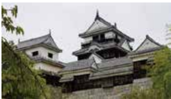
MATSUYAMA CASTLE, BUILT BY TAKAAKI KATO IN THE 17TH CENTURY